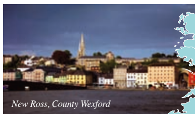
New Ross, County Wexford

For festival enquiries and group bookings email: info@eugeneoneillfestival.com